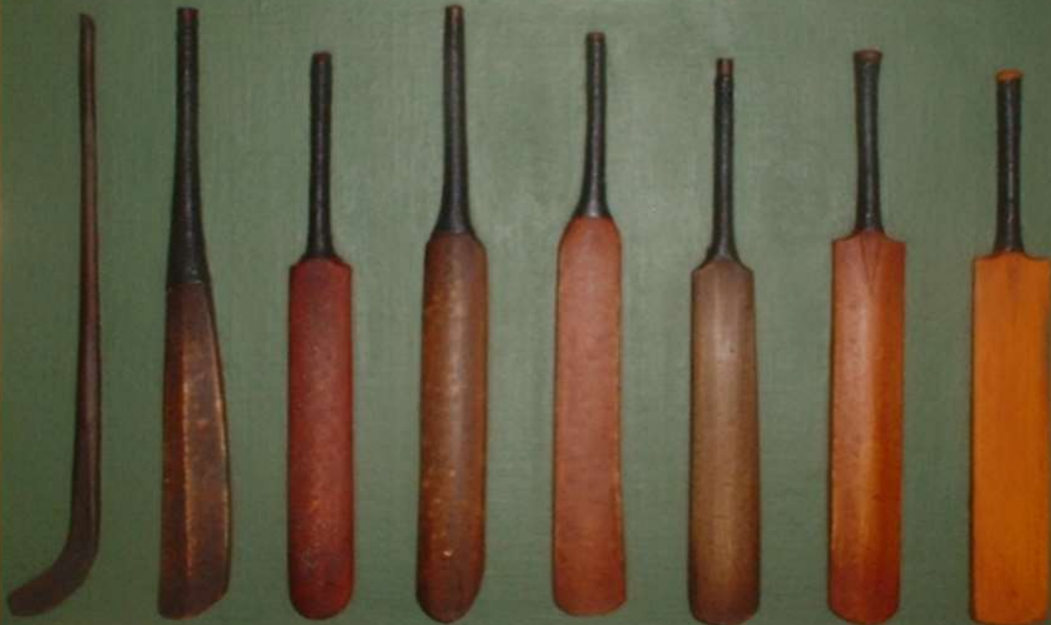
EARLY CURVED BAT C. 1528

ONE SEVENTH SCALE REPLICA OF THE BATS TAKEN FROM THE M.C.C. COLLECTION AT LORD'S CRICKET GROUND