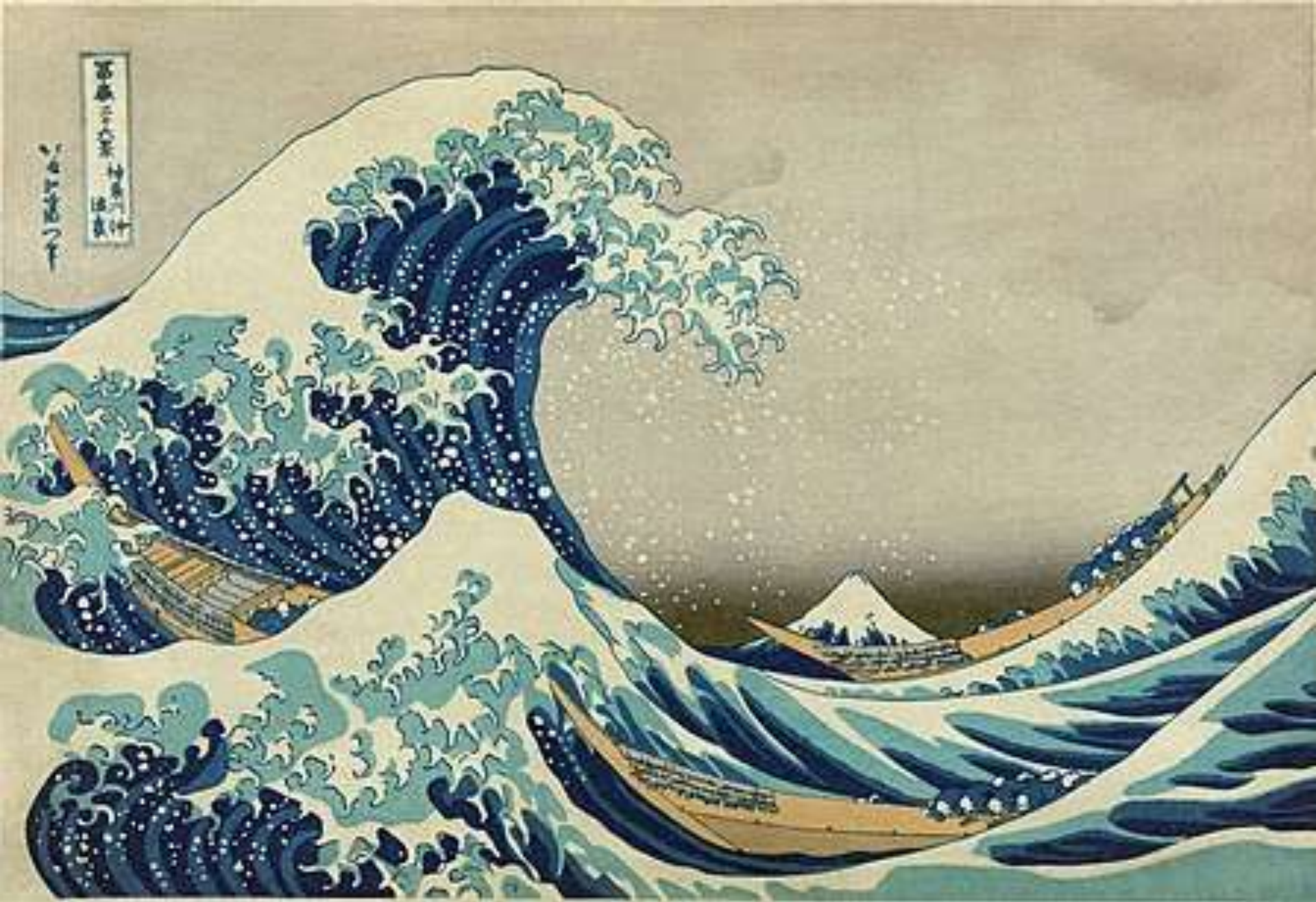
The Great Wave off Kanagawa, Katsushika Hokusai