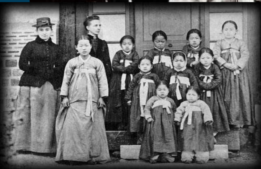
Europeans Arrive In Korea 19 th century