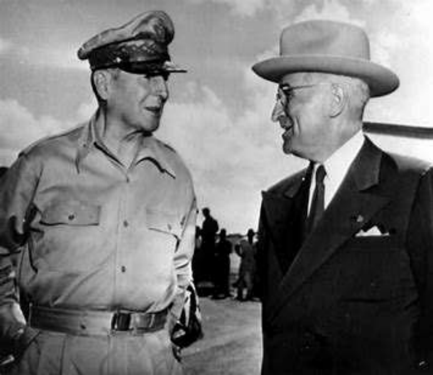
Gen. Douglas MacArthur in Korea