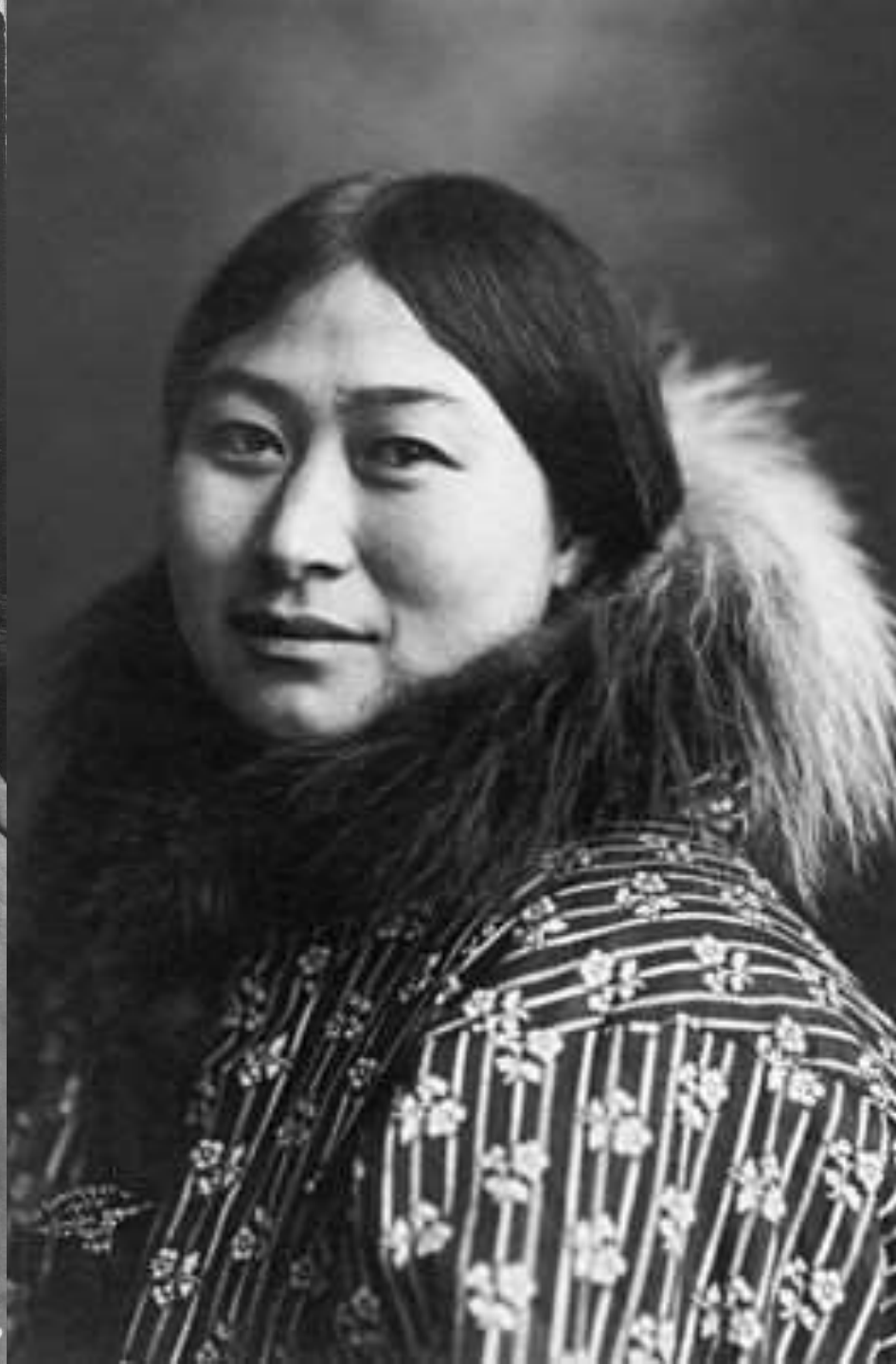
NATIVE ESKIMO, KINGS ISLAND.