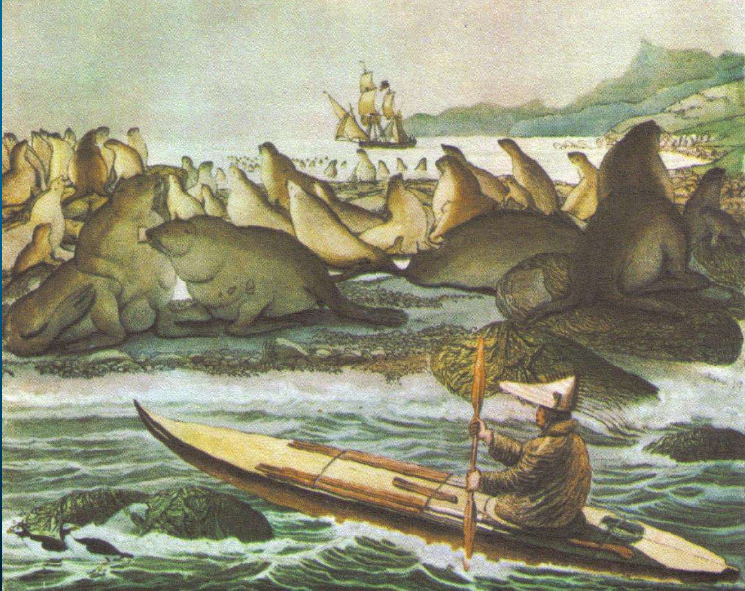
Illustration of an Aleut paddling a baidarka, with an anchored Russian ship in the background, near Saint Paul Island. By Louis Choris, 1817