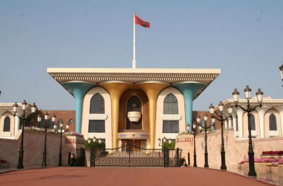
Sultan Qaboos University, in Al Khoudh