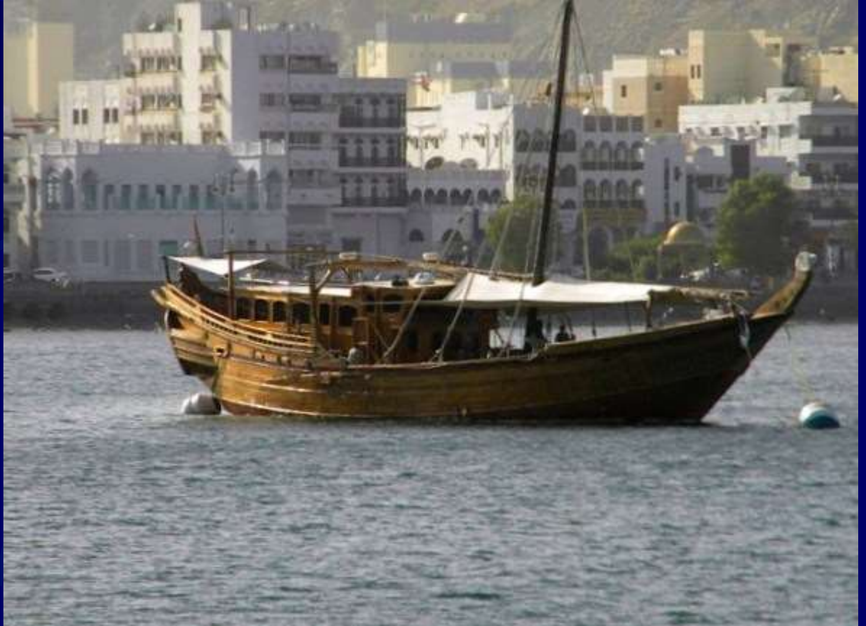
A traditional Dhow, historic symbol of Oman