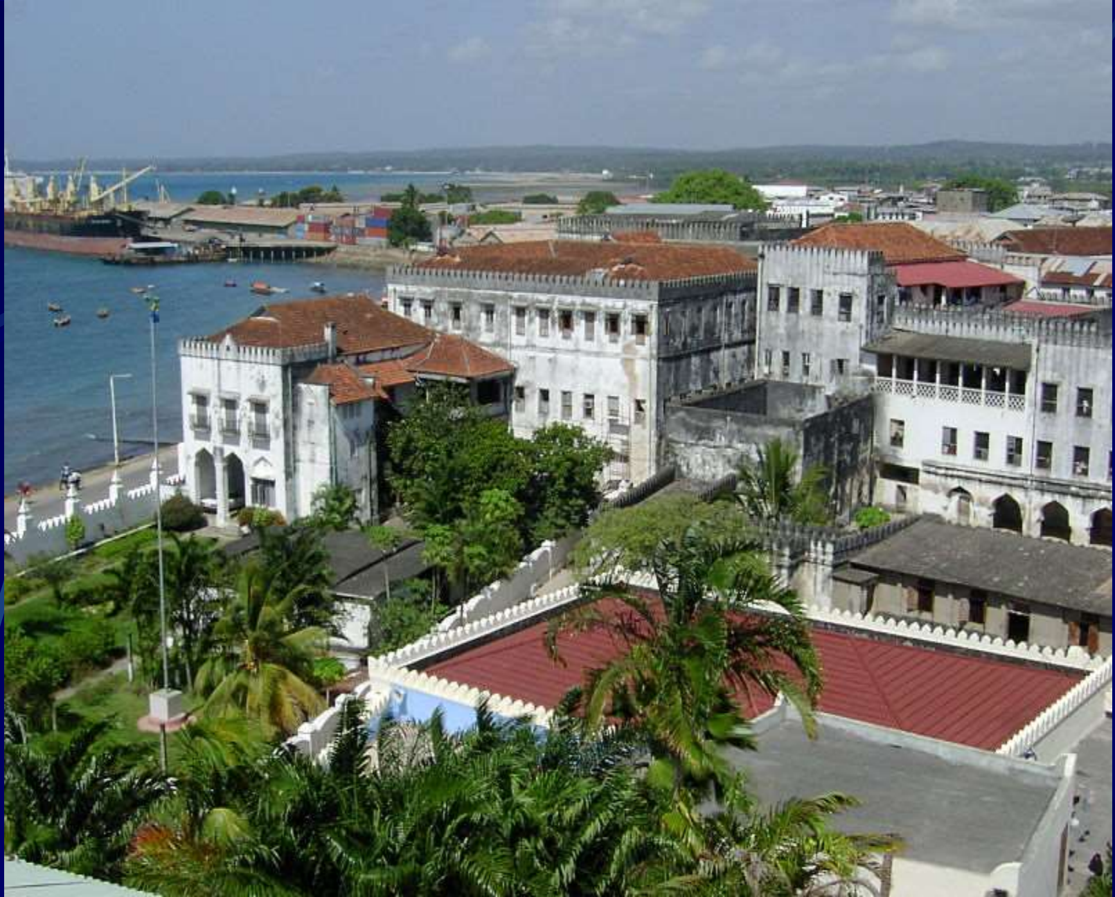
Sultan's Palace, Zanzibar, once Oman's capital & Sultans' residence