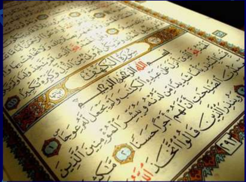
Prophet Muhammad 570-632 AD

لَا إِلَهَ إِلَّا اللَّهُ مُحَمَّدٌ رَسُولُ اللَّهِ