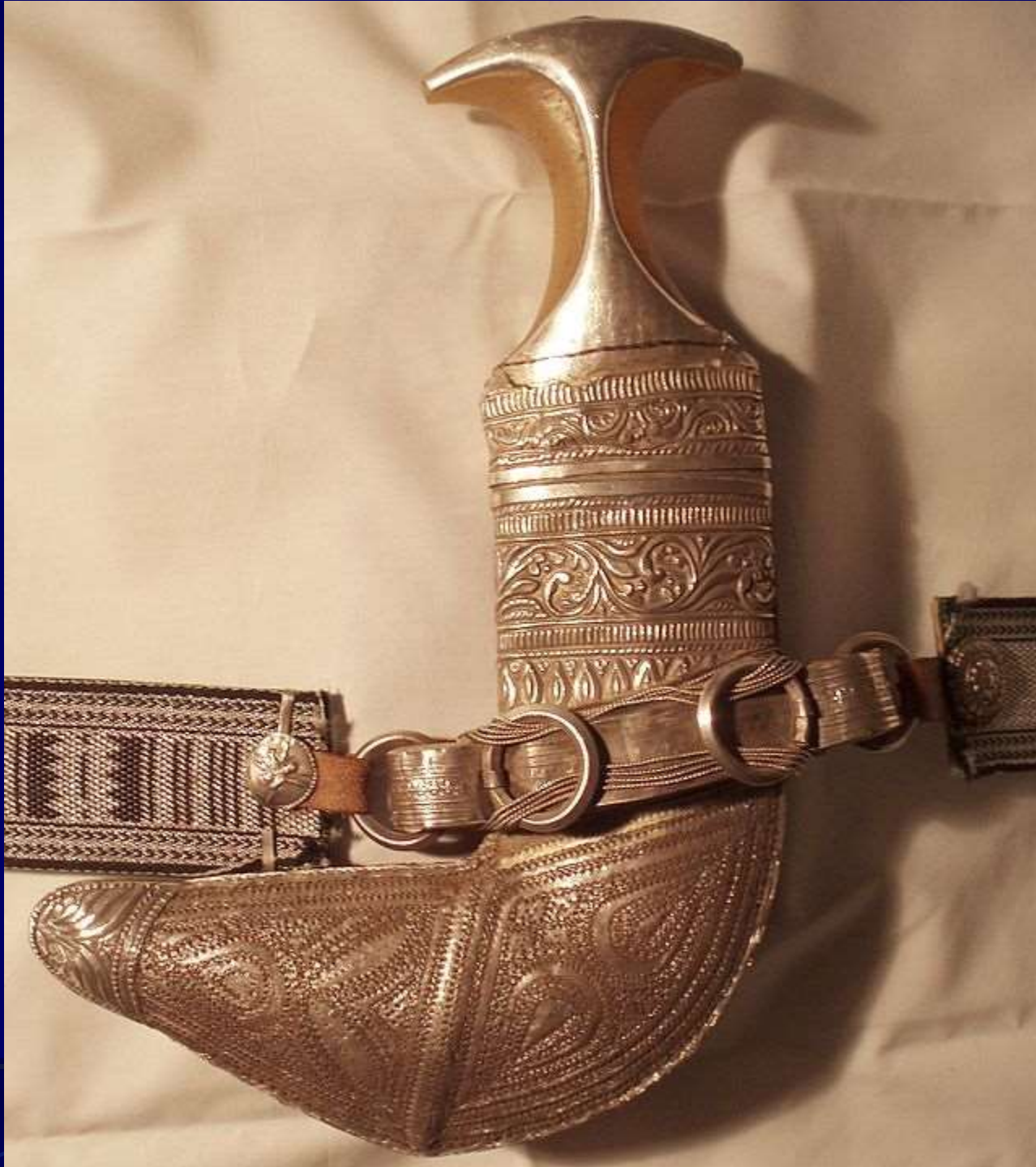
Khanjar dagger A symbol of Oman