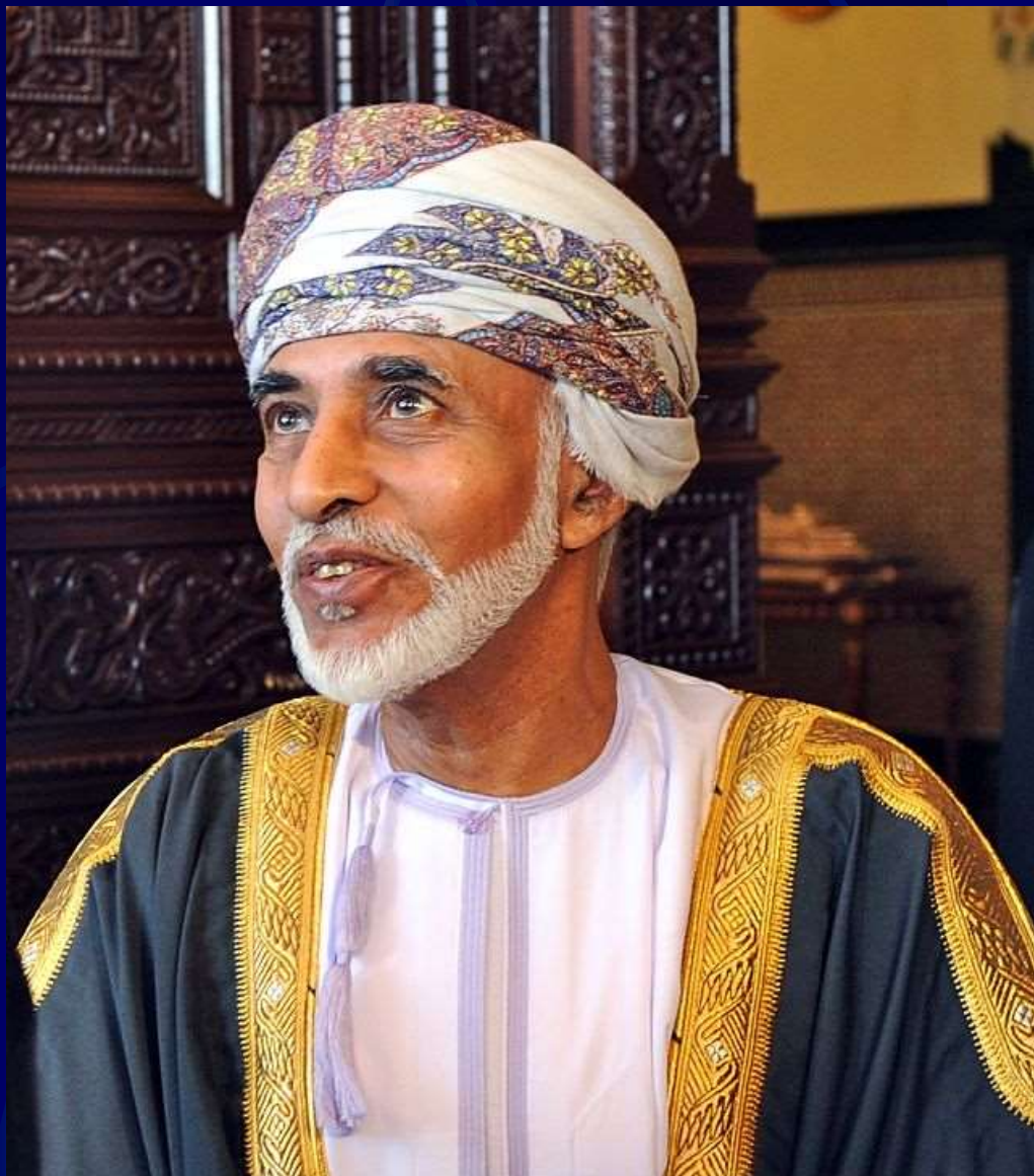
Qaboos bin Said al Said Sultan of Oman August 1970 to present