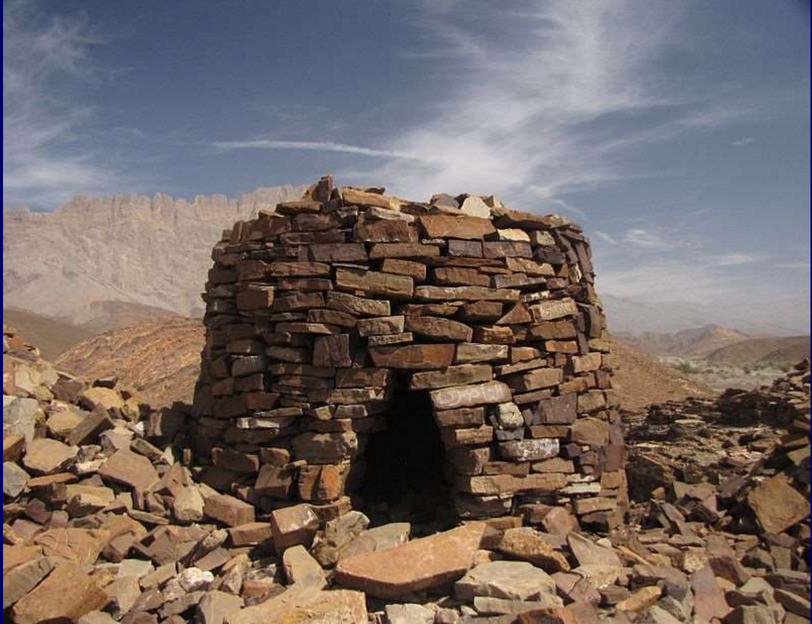
World Heritage Grave at Al Ayn in Oman